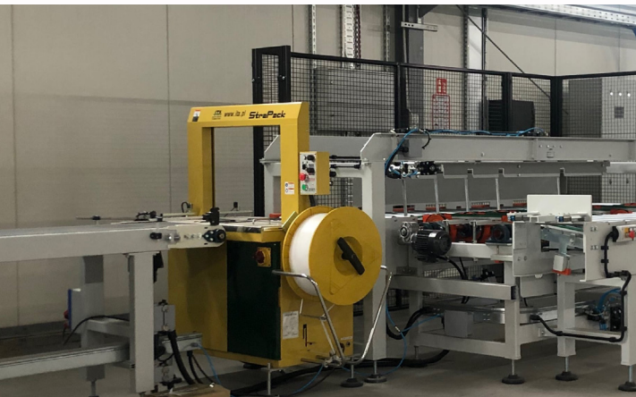
A line for packing floors by Meccanica Moderna Italy