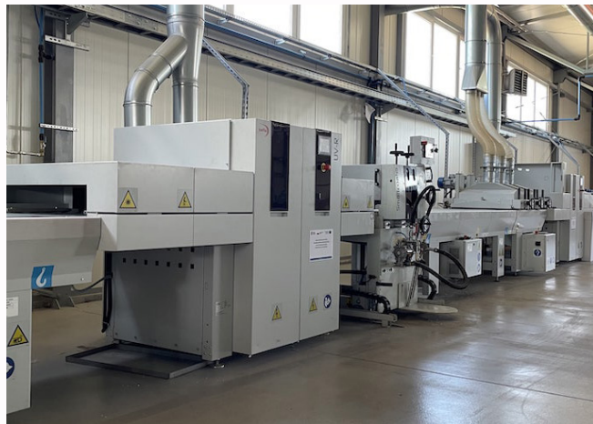
A line for UV oiling and varnishing by CEFLA Finishing Italy