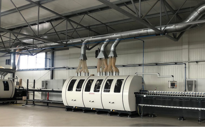
A line for profiling floors by H.B Schroeder GmbH Germany